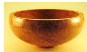
Pepi Waite (above & below)