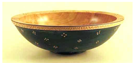
2nd Intermediate, Pepi Waite